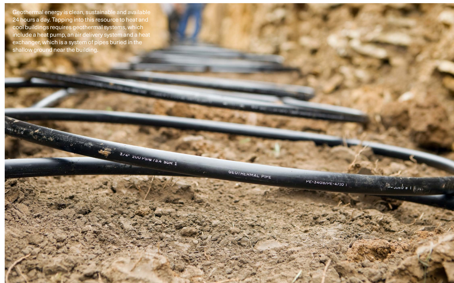
Geothermal energy is clean, sustainable and available 24 hours a day. Tapping into this resource to heat and cool buildings requires geothermal systems, which include a heat pump, an air delivery system and a heat exchanger, which is a system of pipes buried in the shallow ground near the building.

ASTM Committee D34 on Waste Management also continues standards development in the renewable energy field through the efforts of its Subcommittee D34.03 on Treatment, Recovery and Reuse. D34.03 offers an extensive set of standards used in the research and production of refuse-derived fuels (RDF), which consist of organic components of such municipal wastes as plastics and biodegradable waste. Producers and users of RDF benefit from D34 standards such as E953 for fusibility of refuse-derived fuel ash, and E791 for calculating refuse-derived fuel analysis data.