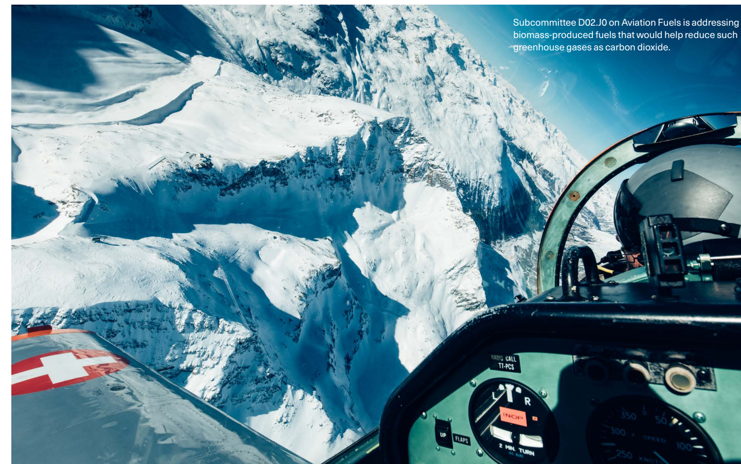
Subcommittee D02.J0 on Aviation Fuels is addressing biomass-produced fuels that would help reduce such greenhouse gases as carbon dioxide.

Committee D02 has earned a worldwide reputation for high quality, market-relevant standards. With its international membership, D02 maintains close alliances and liaison with leading energy consortia and organizations around the globe. Further evidence of D02’s vast global reach can be seen in its Proficiency Testing Programs (PTP) and training courses. PTP is a statistical quality assurance program that enables laboratories to assess their performance in conducting test methods through comparing their data against that of other participating laboratories. Of the more than 3,400 laboratories that participate in the program, more than 58 percent are from outside the United States. Related training courses are high quality continuing technical education programs for industry and government. More than 50 different classes on petroleum products, coal chemistry, environment and other topics are scheduled annually, and a series of online programs is geared toward petroleum laboratory technicians.