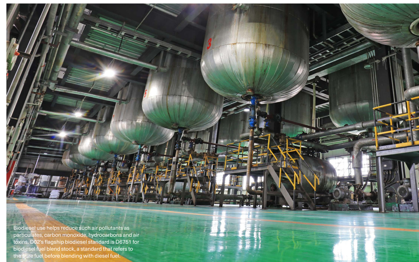
Biodiesel use helps reduce such air pollutants as particulates, carbon monoxide, hydrocarbons and air toxins. D02’s flagship biodiesel standard is D6751 for biodiesel fuel blend stock, a standard that refers to the pure fuel before blending with diesel fuel.