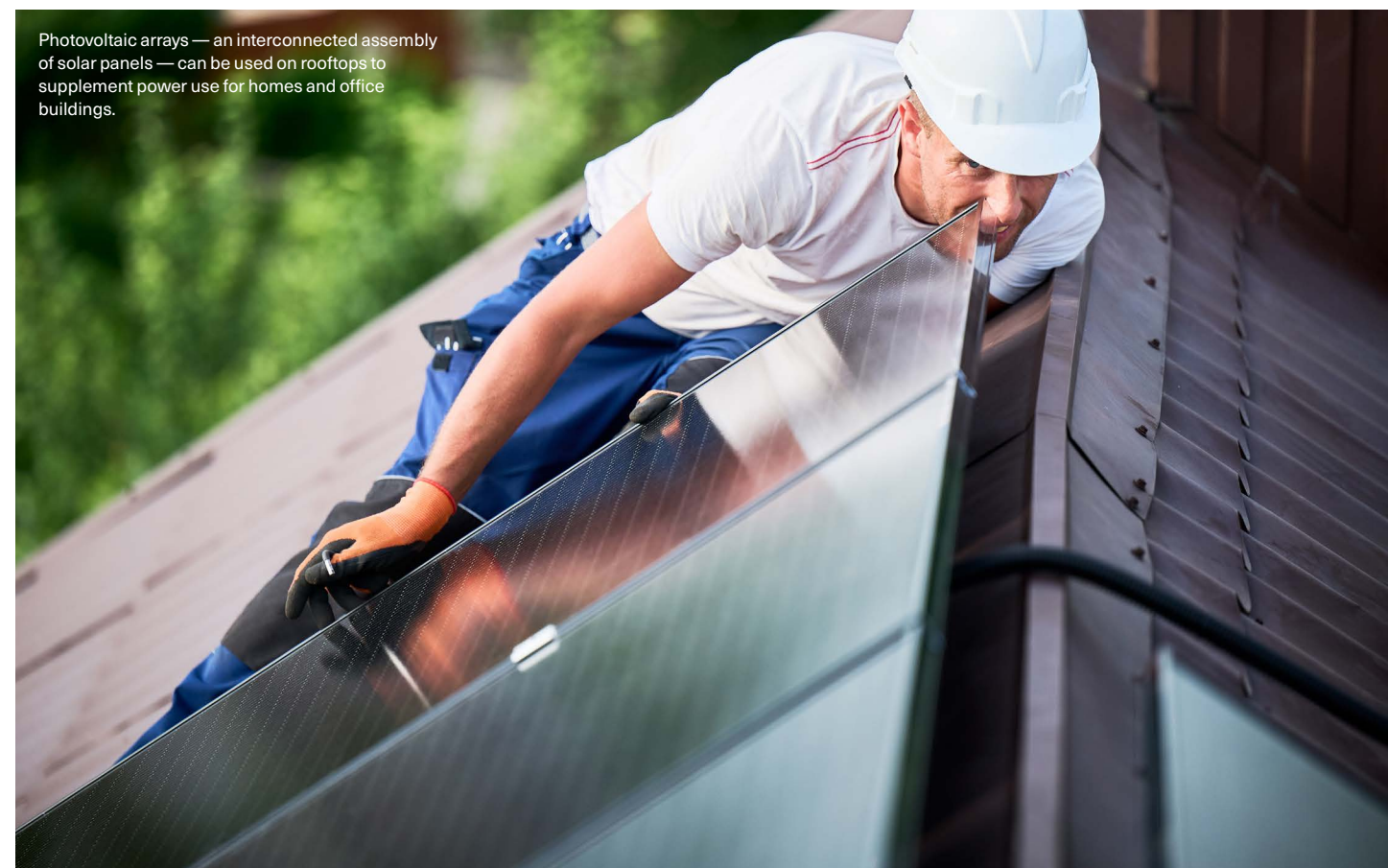
Photovoltaic arrays — an interconnected assembly of solar panels — can be used on rooftops to supplement power use for homes and office buildings.