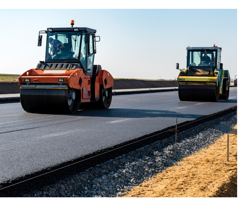
ASTM D2171 — Standard Test Method for Viscosity of Asphalts by Vacuum Capillary Viscometer

ASTM D2166 — Standard Test Method for Unconfined Compressive Strength of Cohesive Soil