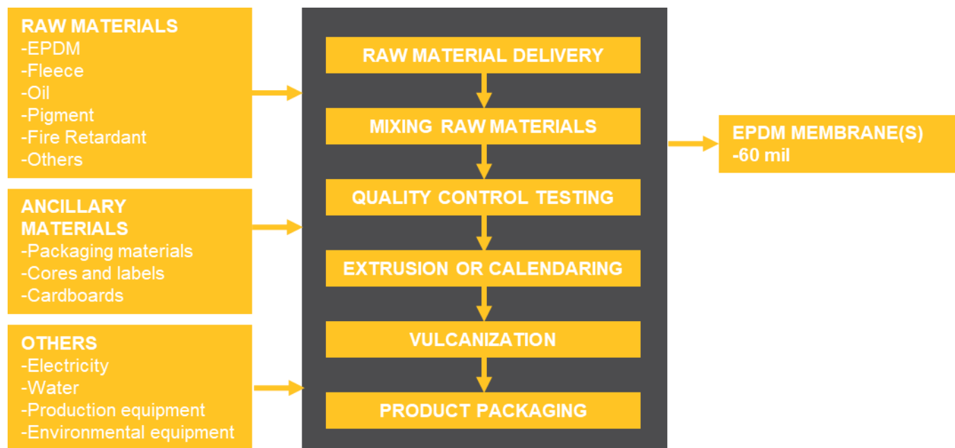
Figure 1: VersiGard® Non-Reinforced QA EPDM production process map