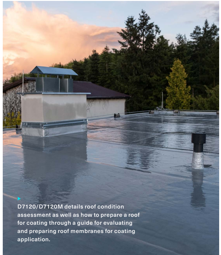
▶ D7120/D7120M details roof condition assessment as well as how to prepare a roof for coating through a guide for evaluating and preparing roof membranes for coating application.