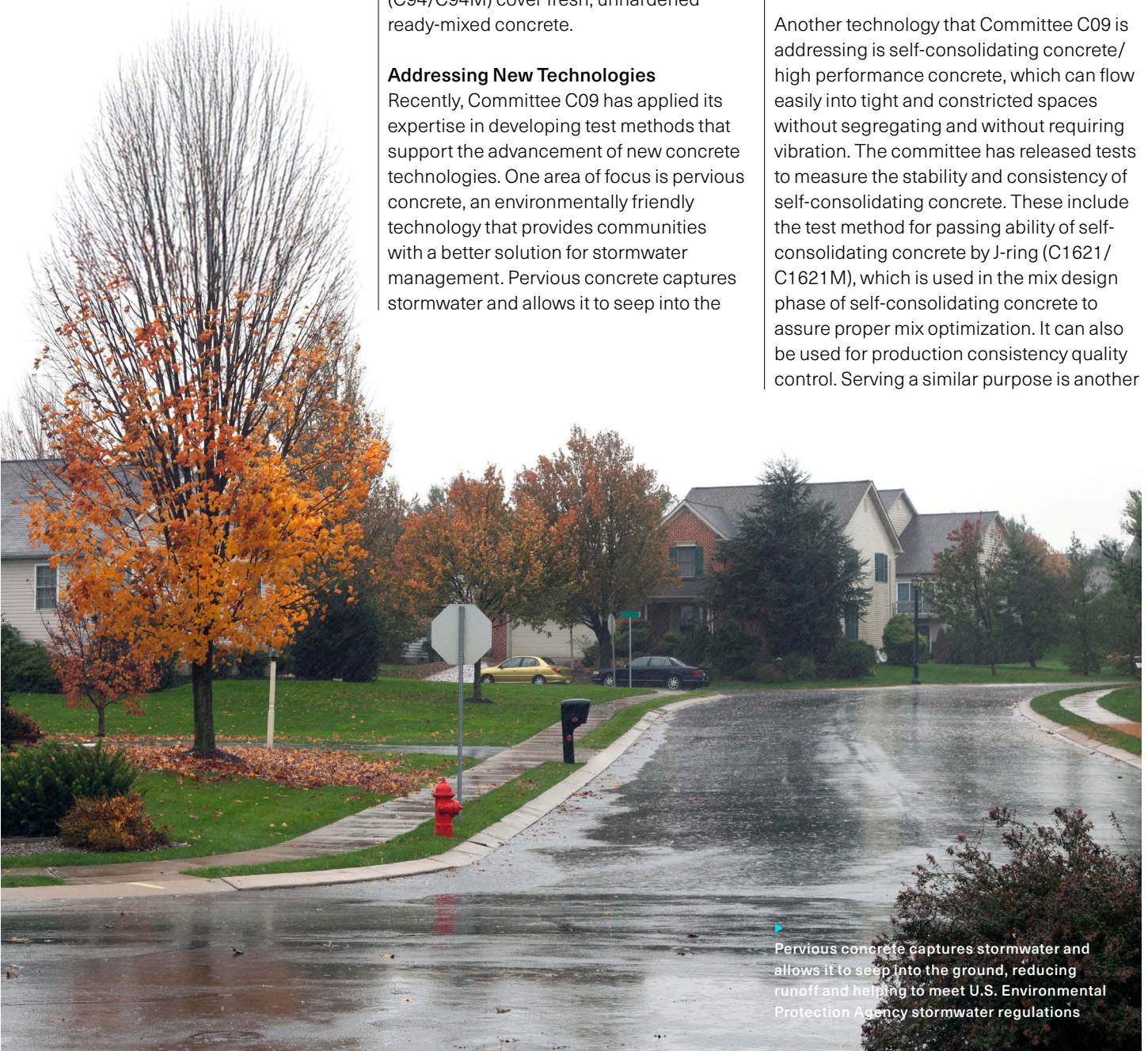
▶ Pervious concrete captures stormwater and allows it to seep into the ground, reducing runoff and helping to meet U.S. Environmental Protection Agency stormwater regulations

Another technology that Committee C09 is addressing is self-consolidating concrete/high performance concrete, which can flow easily into tight and constricted spaces without segregating and without requiring vibration. The committee has released tests to measure the stability and consistency of self-consolidating concrete. These include the test method for passing ability of self-consolidating concrete by J-ring (C1621/C1621M), which is used in the mix design phase of self-consolidating concrete to assure proper mix optimization. It can also be used for production consistency quality control. Serving a similar purpose is another