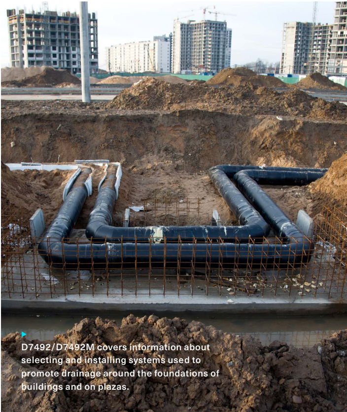
▶ D7492/D7492M covers information about selecting and installing systems used to promote drainage around the foundations of buildings and on plazas.