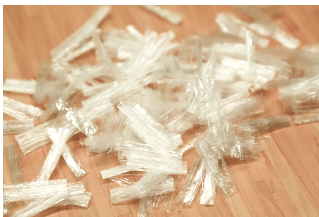
Figure 1: ECONO-NET ® product visual representation.

The declared product is ECONO-NET (shown in Figure 1), ECONO-NET is an easy to finish, fully oriented, 100% virgin homopolymer polypropylene fibrous reinforcement in a collated fibrillated (network) form. ECONO-NET is used to reduce plastic and hardened concrete shrinkage, improve impact strength, increase fatigue resistance and concrete toughness. This medium-duty fiber offers good-bonding power, long-term durability, and true secondary/temperature control by incorporating a fibrillated pattern and long length option. Non-corrosive, non-magnetic, chemically inert, and 100% Alkali Proof!