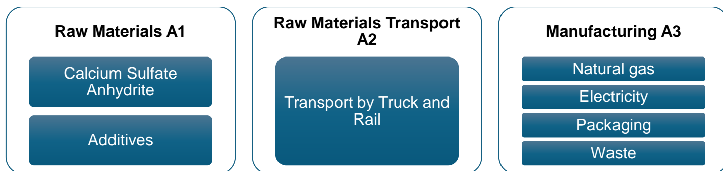
Figure 1: Specific processes covered by this EPD by life cycle stage

This EPD represents a “cradle-to-gate” LCA analysis for USG Red Top® Keenes Cement. It covers all the production steps from raw material extraction (i.e., the cradle) to finished product on wooden pallets (i.e., the gate).