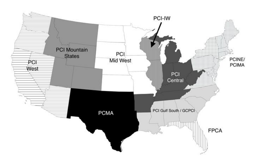
Figure 1: PCI Production Regions Considered in this Study.