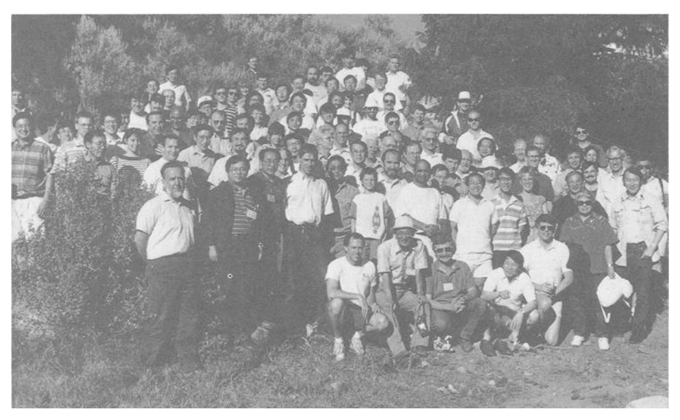
FIG. 1—Symposium attendees.

Finally, in order to be fair to those authors at this symposium whose papers could not be