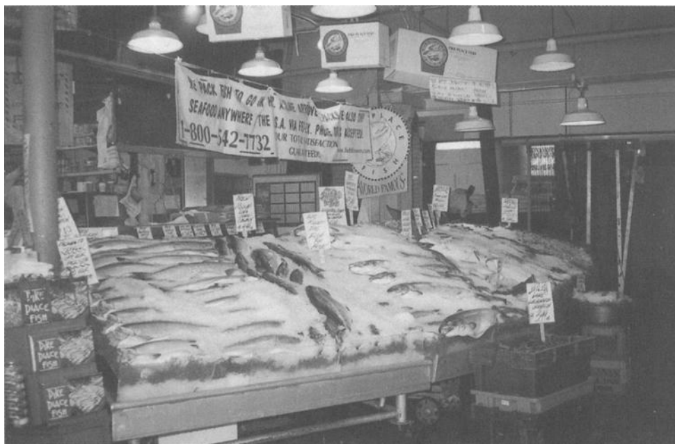
FIG. 2— Continued