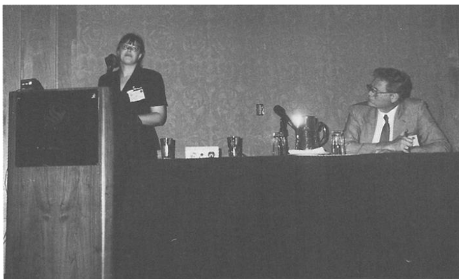
FIG. 2— Continued