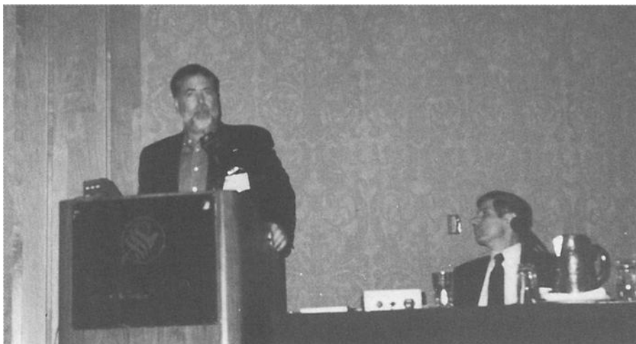
FIG. 2(a-f)— These figures depict various illustrations of events of the Symposium.