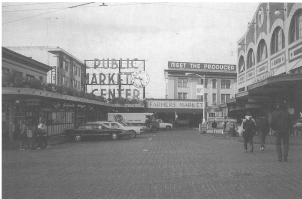
FIG. 2— Continued