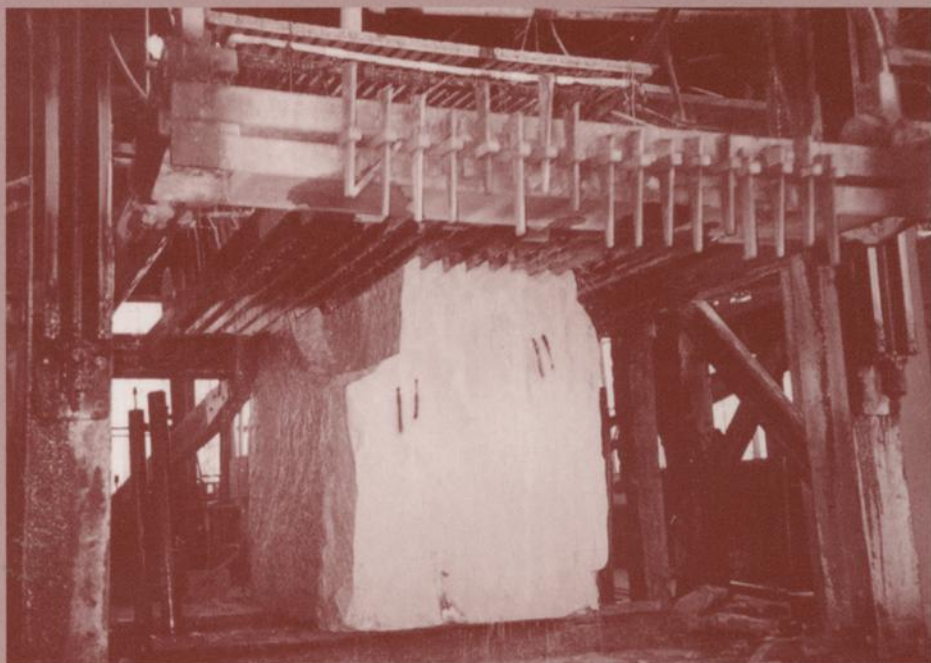
Marble quarry block is being sawed into slabs for use on a building façade