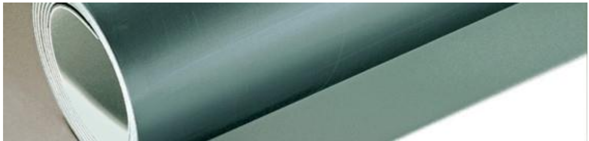
Figure 1 White, SPPR PVC roofing membrane

A white, SPPR PVC roofing membrane consists of two plies or layers of PVC material with a polyester reinforcement scrim between the layers. The top ply has special additives to make the membrane UV stable, plasticizers to make it flexible, and pigments for color. The bottom ply is typically darker in color containing fewer pigments by weight, but otherwise contains a similar mix of plasticizers, stabilizers, fillers and fire retardant additives.